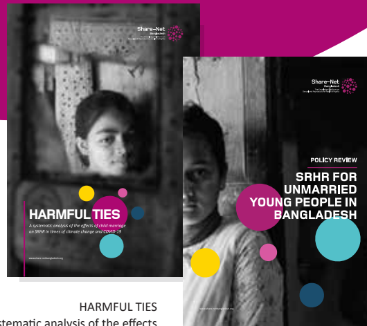
HARMFUL TIES A systematic analysis of the effects of child marriage on SRHR in times of climate change and COVID-19

It is the annual flagship event of Share-Net Bangladesh. On a focused theme from the broad umbrella of SRHR, experts, specialists, researchers, academicians, practitioners, students from around the country come together to showcase their work, share and learn new knowledge. The event hosts plenary and thematic sessions, poster presentations, stall exhibitions, SRHR recognition award and much more.